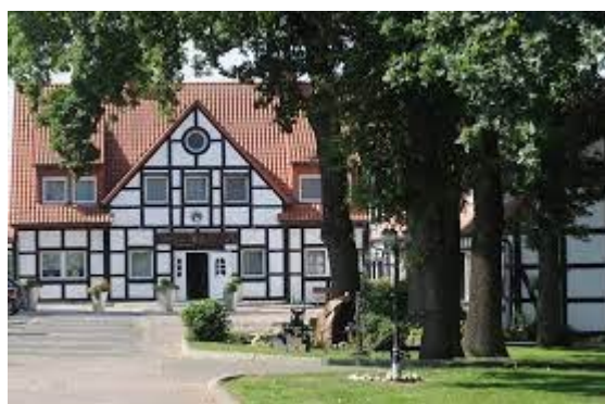
Landhotel Baumann's Hof